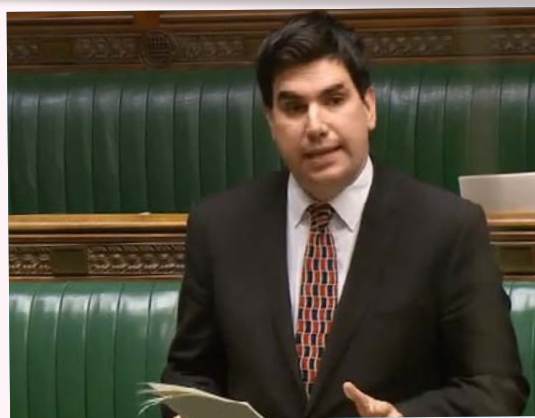
Standing Up For East Leeds in Parliament