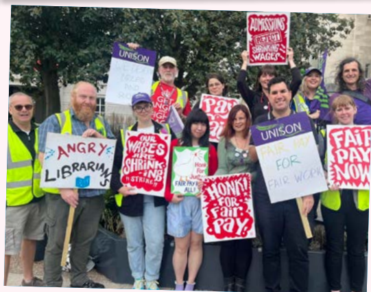
Supporting low paid local workers