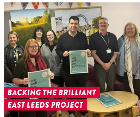
BACKING THE BRILLIANT EAST LEEDS PROJECT