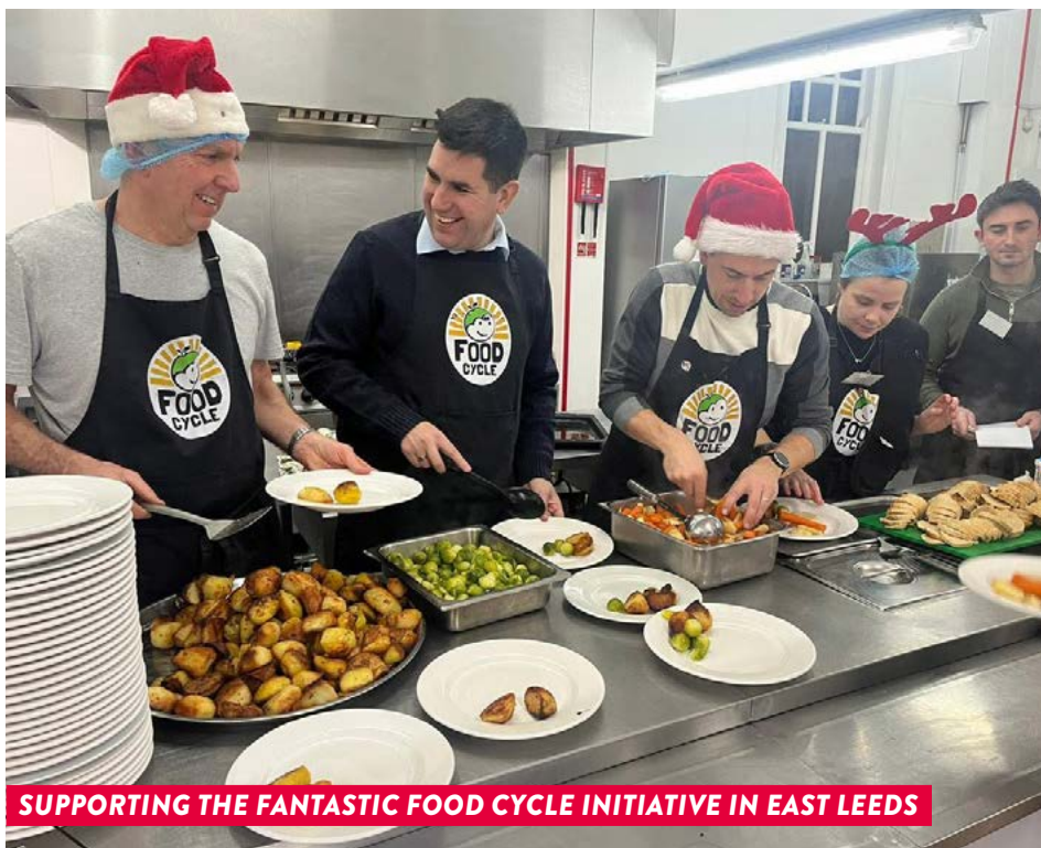
SUPPORTING THE FANTASTIC FOOD CYCLE INITIATIVE IN EAST LEEDS