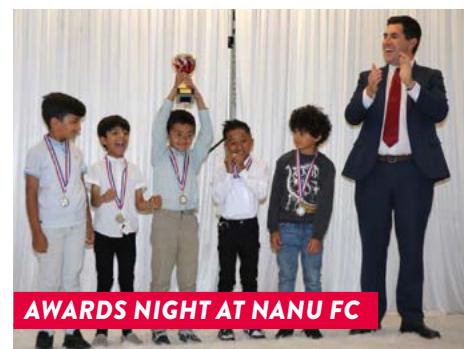
AWARDS NIGHT AT NANU FC