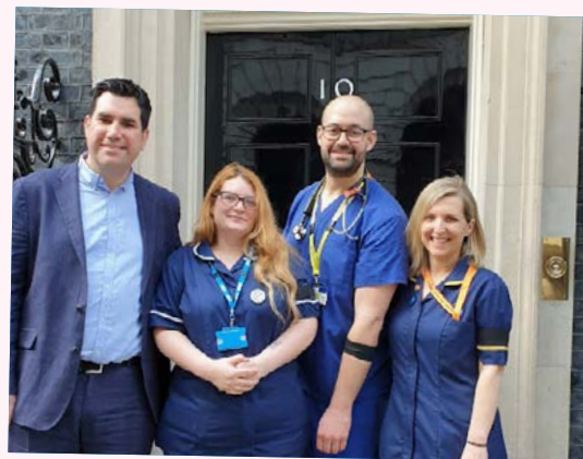
Taking the fight for our NHS to 10 Downing Street